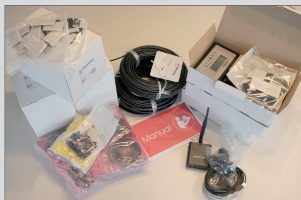
Starter Kit 50/2