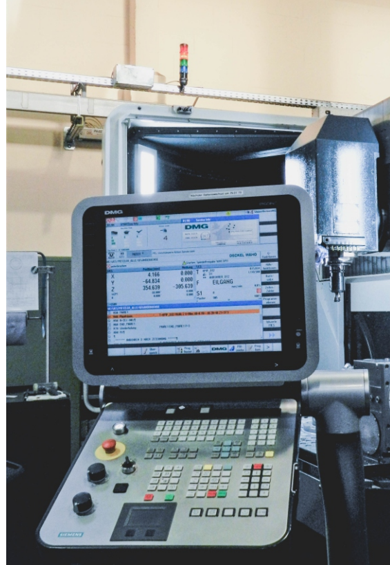
The signal towers were mounted above the machines and are also clearly visible from a distance

'We started our trial with the WERMA monitoring system on a CNC lathe, which we had suspected for some time was working unproductively,' says Donner. 'We wanted to know exactly how long the set-up times are and how we can shorten these times in order to be win more machining time.' Since VETEC has long relied on signal towers from WERMA, which quickly and clearly indicate faults on each machine and thus provide visual monitoring, just the wireless slave transmitter had to be fitted onto the existing tower. 'We could get started immediately', enthuses Donner. 'The great thing was you could see the first results after just one day: