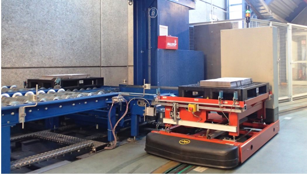
A total of 12 AGVs at Continental Regensburg are fitted with the WERMA WIN system. The automotive industry supplier has been able to reduce reaction time to a minimum thus safeguarding their competitive edge.

The WERMA WIN equipment consists of green and yellow lights on a signal tower complete with a wireless transmitter which acts as a monitoring and data collection system and thus is ideal for the optimisation of logistics and manufacturing operations.