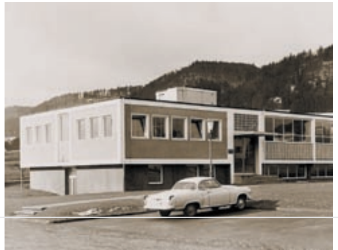
The first WERMA-building of 1950